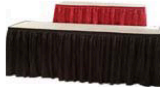
Table Skirt Color: _____ blue _____ red _____ burgundy _____ black _____ green _____ yellow _____ white

(Standard table height is 30in. Add $40 for a 40in high skirted table.) (All sizes skirted on three sides. For skirt on 4th side, add $20 on 30in tall table, $30 on 40in tall table)